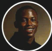
MEN'S CONSECRATED LIFE