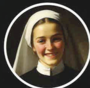
WOMEN'S CONSECRATED LIFE