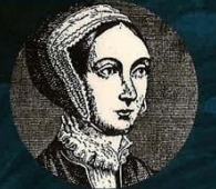
ST. MARGARET CLITHEROW